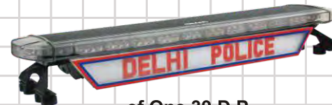
ef One 39 D.P.