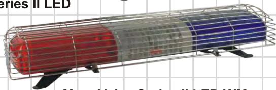
Mars Voice Series II LED WM