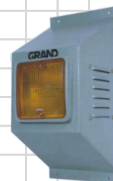
ALERTRONIC BANK ALERT