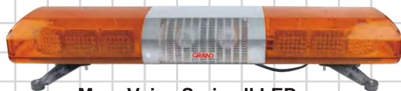
Mars Voice Series II LED