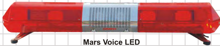
Mars Voice LED