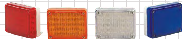
LED Flashing Light G-31 Sq