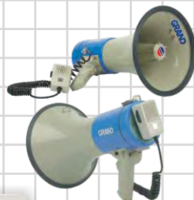
GM 20 S