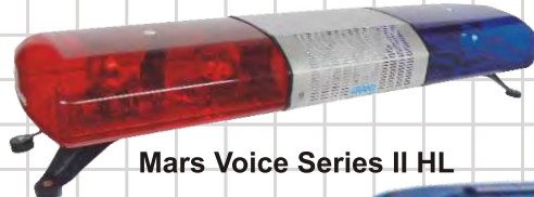
Mars Voice Series II HL