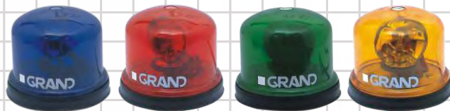
GM -101 All Colours