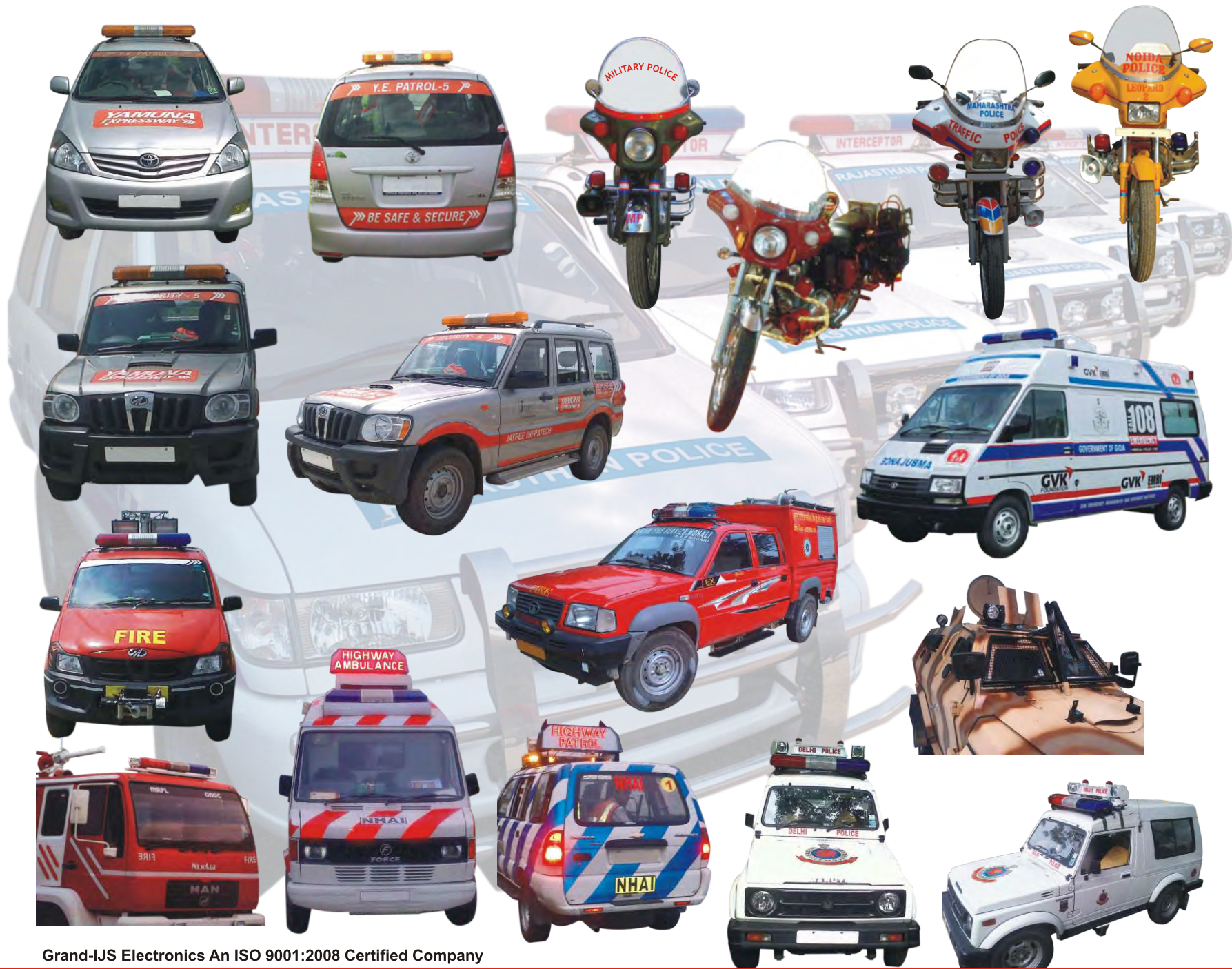
Grand-IJS Electronics An ISO 9001:2008 Certified Company