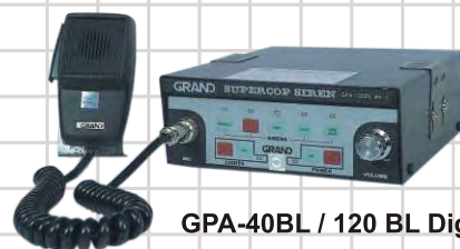
GPA-40BL / 120 BL Digital