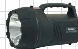
Mini Visibeam LED

For Detailed Specifications Contact : grandinfo2004@yahoo.com