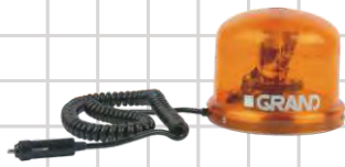
GM -101M(WITH MAGNET) ALL COLOURS