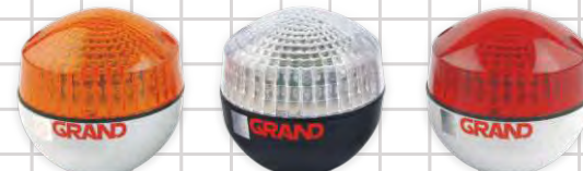
LED Flashing Light GM-901 LED