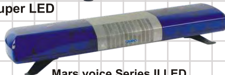
Mars voice Series II LED