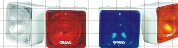
LED Side Blinking Light-GSBL-LED/HL